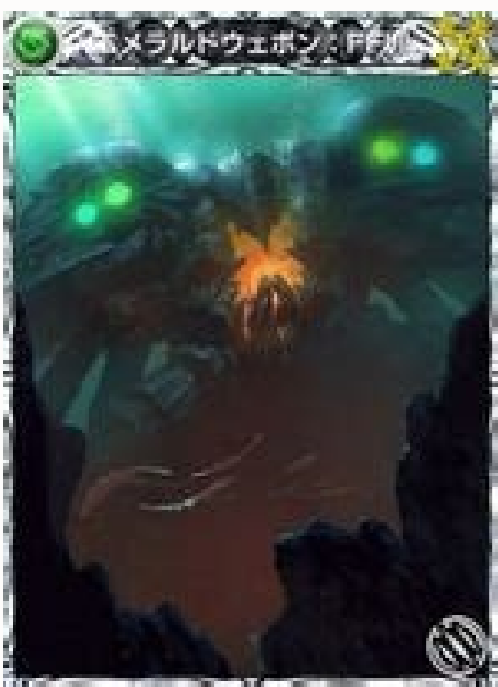
FF7 ruby emerald weapon guide.